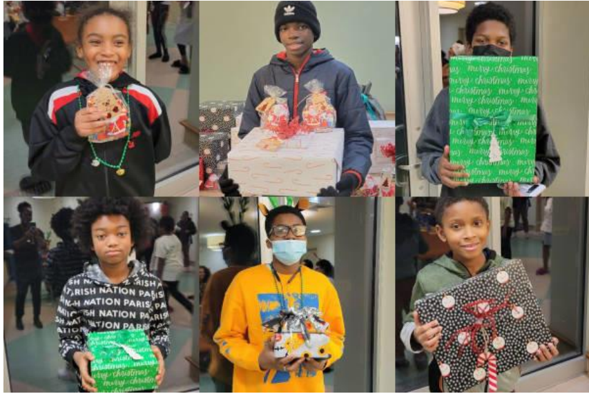
Children receiving their gifts.